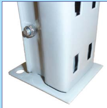
Heavy duty reversible baseplate